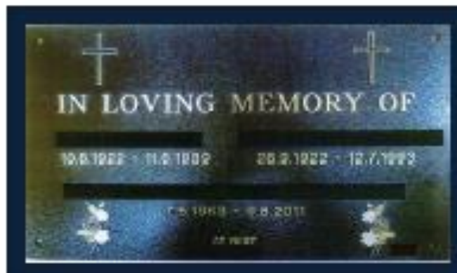
3. Triple Plaque Proof Complete (Directly Inscribed)