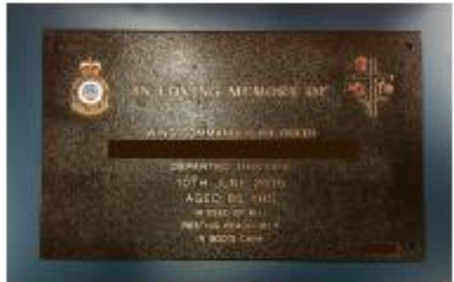
1. Single Plaque Completed