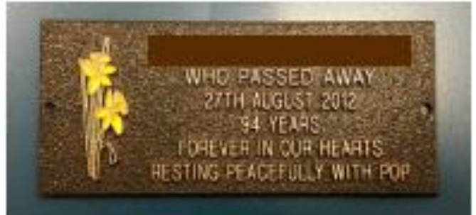
4. Detachable Plate Complete