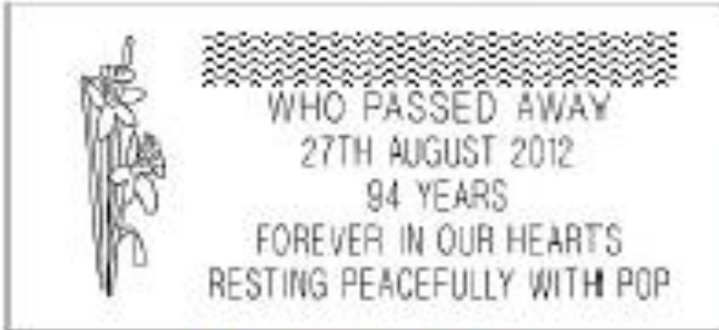
4. Detachable Plate Proof