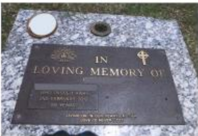
6. Alternative Plinth + Photo & Vase