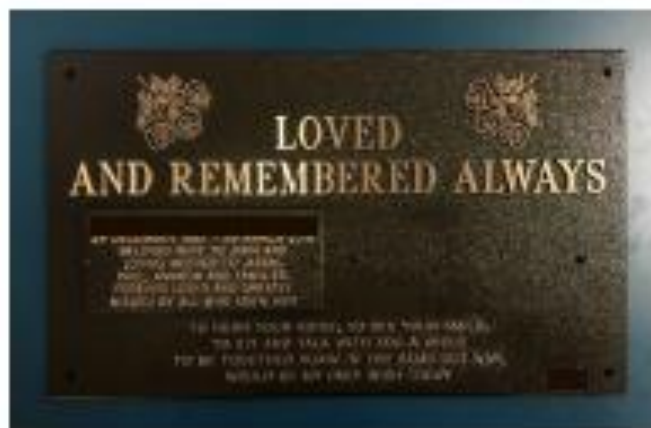
2. Double Plaque Proof Complete (Detachable Plate)