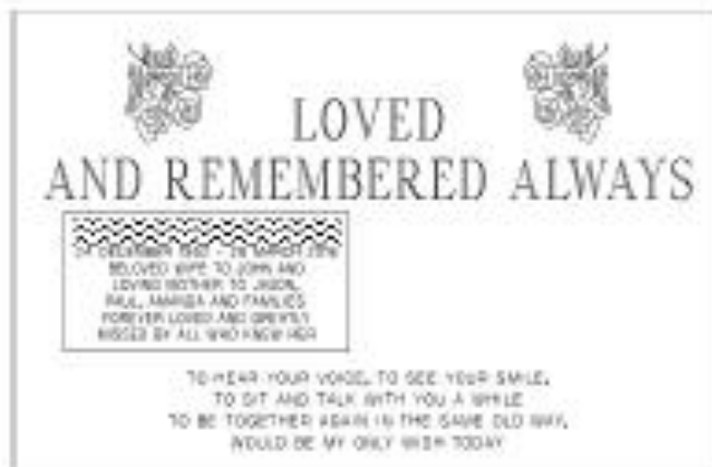
2. Double Plaque Proof (Detachable Plate)