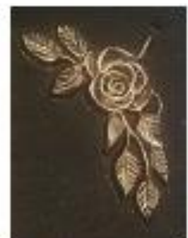
7. 3 Dimensional Emblems