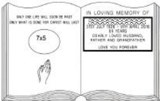
5. Book Border Plaque Proof