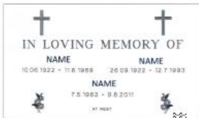
3. Triple Plaque Proof (Directly Inscribed)