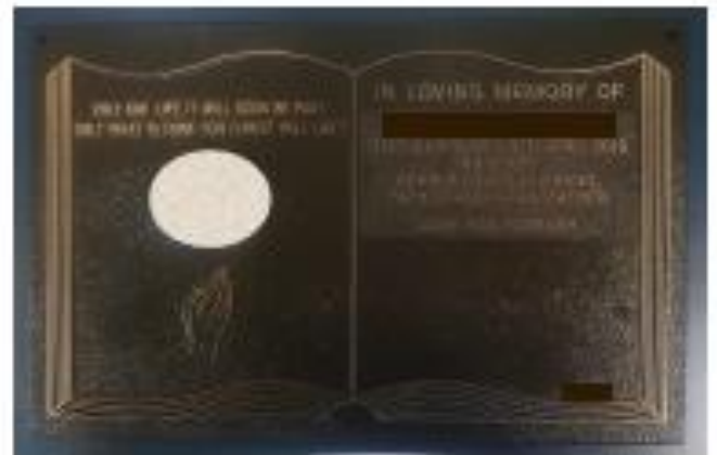
5. Book Border Plaque Complete