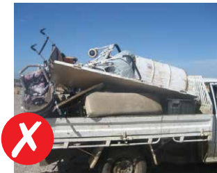
What not to do