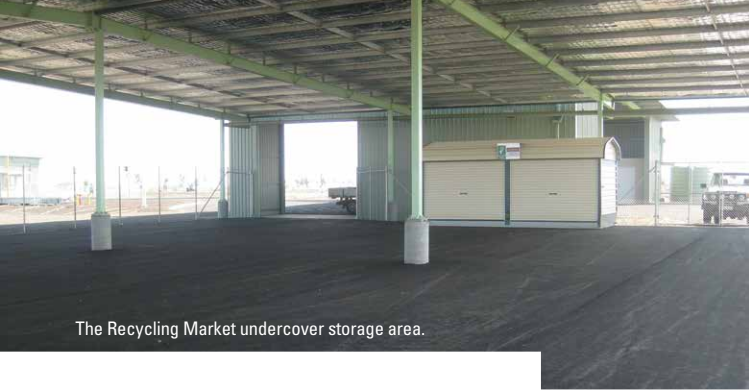
The Recycling Market undercover storage area.