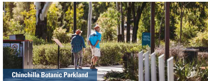
Chinchilla Botanic Parkland