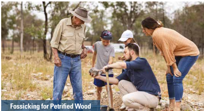
Fossicking for Petrified Wood

Get off the highway and drive along the many sealed roads around Chinchilla that form a grid-pattern amongst flat farming areas, or wind your way around the district's undulating terrain. Drive past fields lush with crop varieties, look for paddocks of grazing cattle or marvel at the infrastructure of the resource industry in the region.