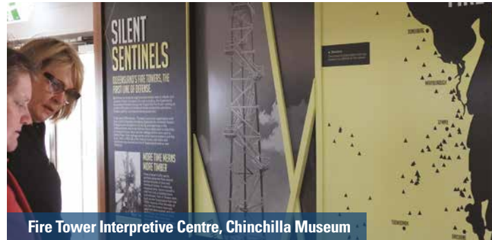
Fire Tower Interpretive Centre, Chinchilla Museum