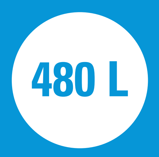
Target 480 L per person per day