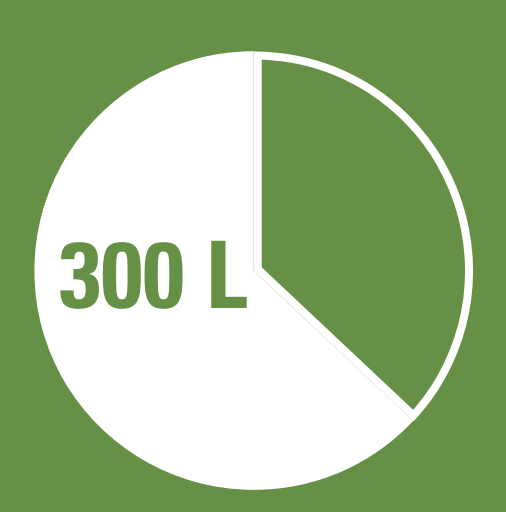
Target 300 L per person per day

For more information 📞 1300 COUNCIL 🖂 info@wdrc.qld.gov.au 🕮 www.wdrc.qld.gov.au