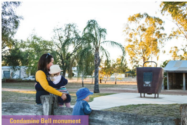
Condamine Bell monument

Why not venture off the main highways to immerse yourself in the true heart of the Western Downs.