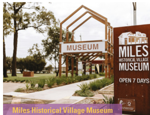
Miles Historical Village Museum