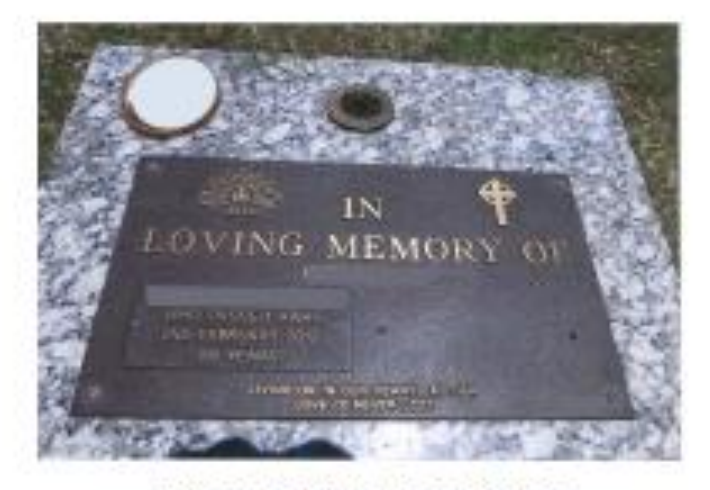
Alternative Plinth + Photo & Vase