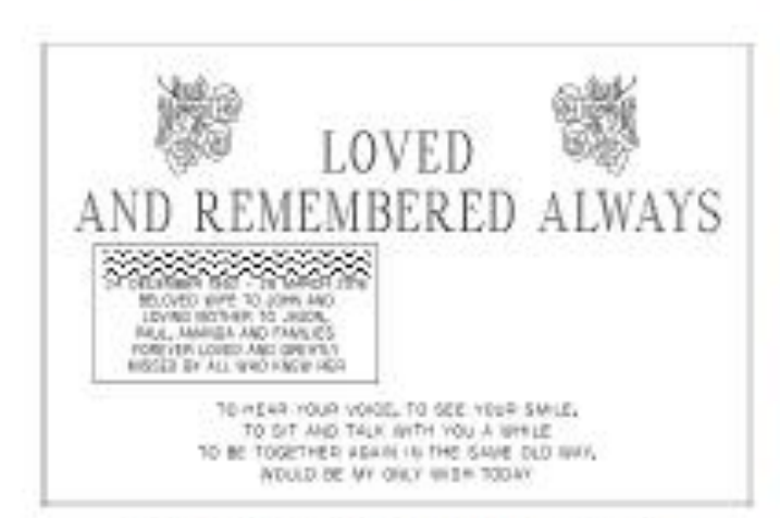
1. Single Plaque Proof

2. Double Plaque Proof (Detachable Plate)