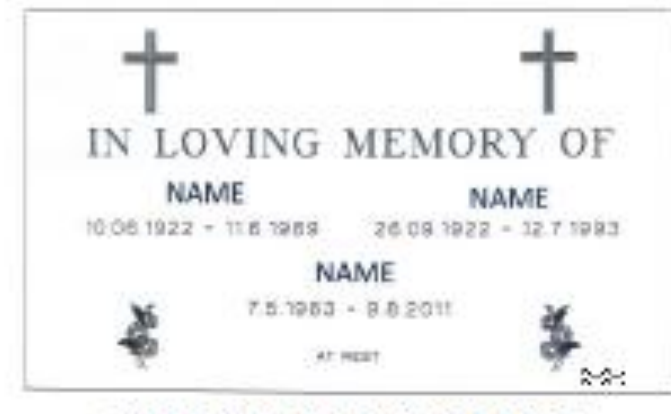
3. Triple Plaque Proof (Directly Inscribed)

Double Plaque Proof Complete (Detachable Plate)