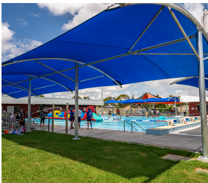
Tara Aquatic Centre