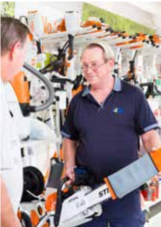
Dalby Mower Supplies