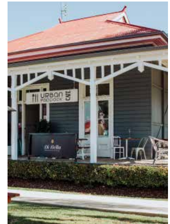
Urban Paddock in Dalby