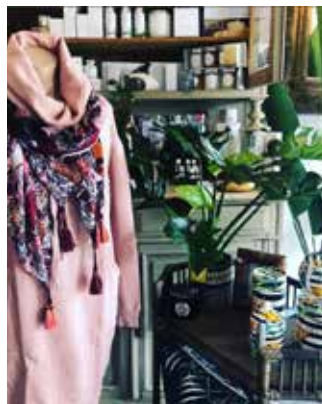
Bella & Spice in Dalby