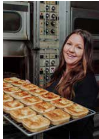
Maces Bakery in Miles