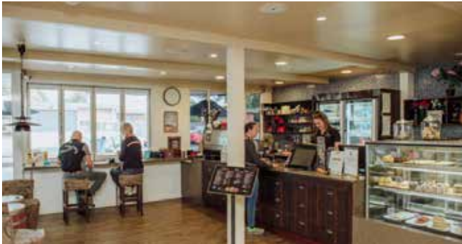
Chinchilla Downtown Cafe

Thanks to the resources sector, the Gross Regional Product (GDP) has increased by 34% over five years to reach nearly $4.07 billion