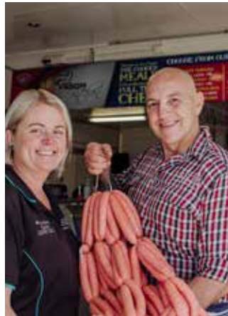
Dalby Southside Butcher